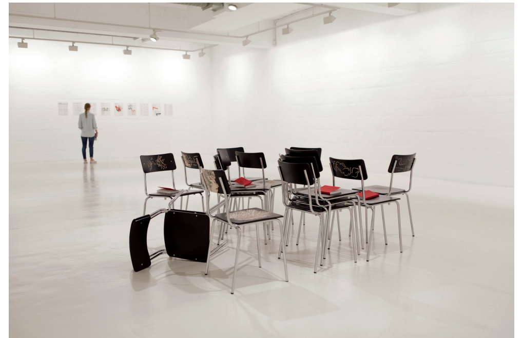
Priscila Fernandes The Book of Aesthetic Education of the Modern School , 2014 Installation view