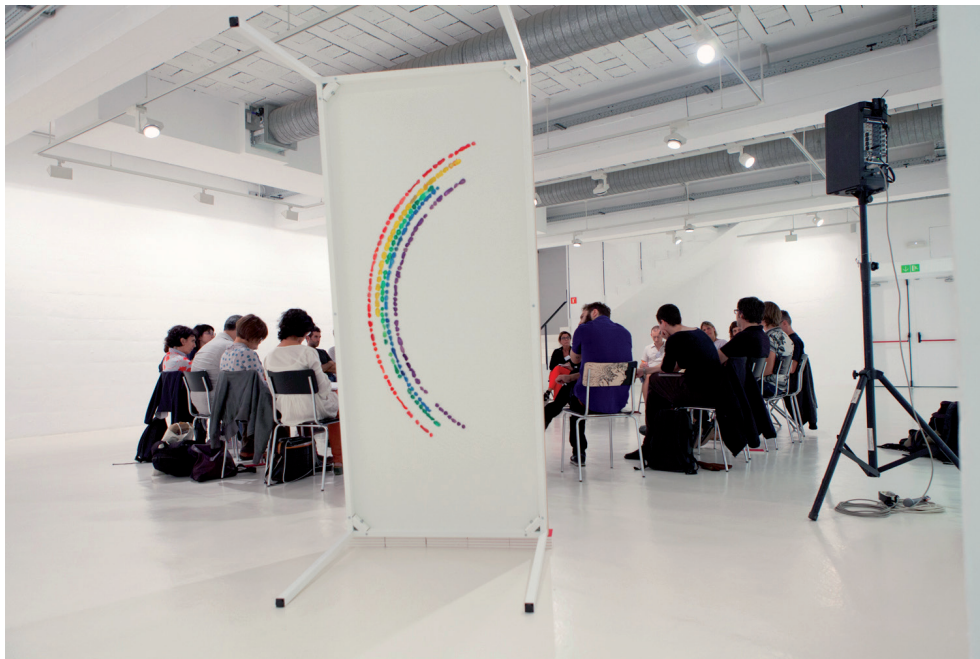
Friction Pedagogies Introductory session of the Teachers' Course [October 16, 2014]