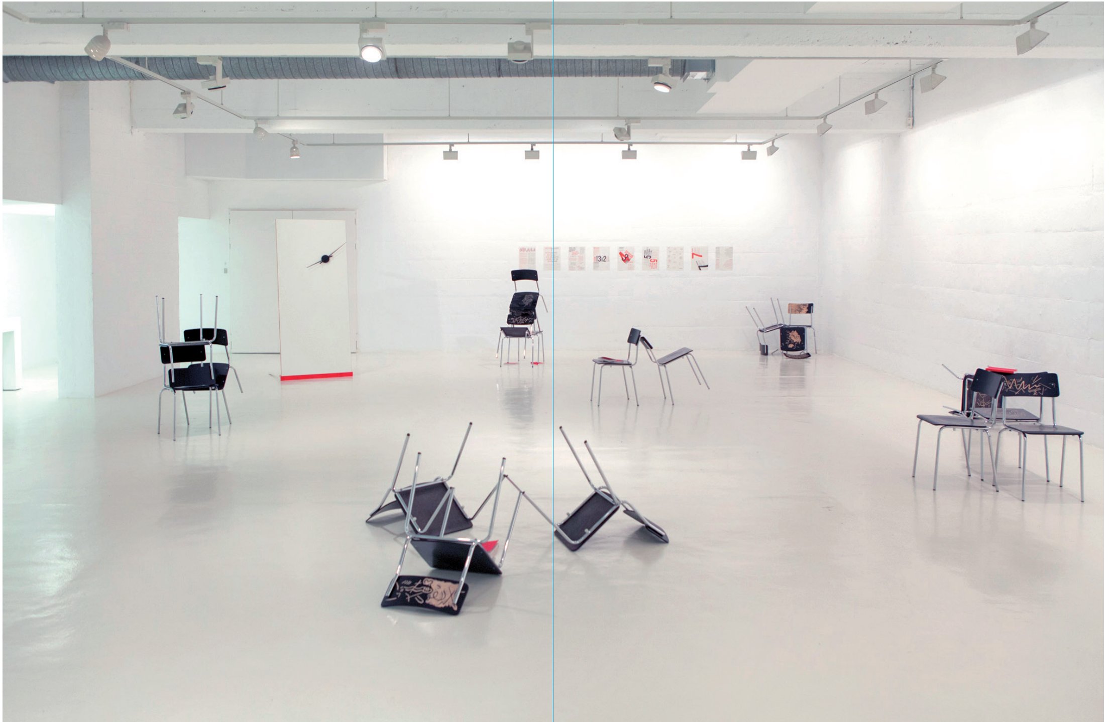
Priscila Fernandes The Book of Aesthetic Education of the Modern School , 2014 Installation view