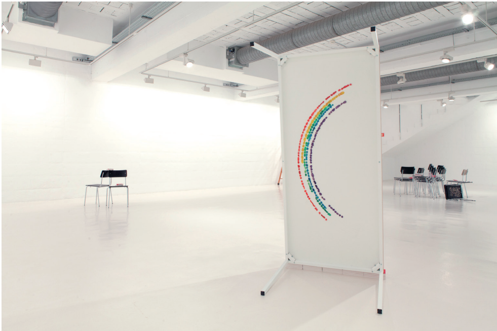
Priscila Fernandes The Book of Aesthetic Education of the Modern School , 2014 Installation view